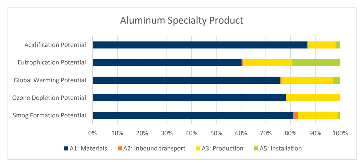
Figure 4-2: TRACI 2.1 impact assessment results for 1 kg of aluminum product

In an effort to be consistent with declarations written in accordance with EN 15804, the CML 2001- April 2013 impact assessment results are calculated in addition to TRACI 2.1 results (detailed above). These results are summarized in Table 4-5.